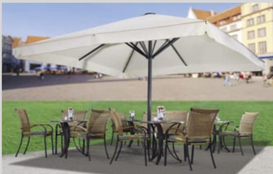
The robust connecting rod is available in either elegant slate-grey or in classic white. It is also available in other RAL-colours against a small extra charge.