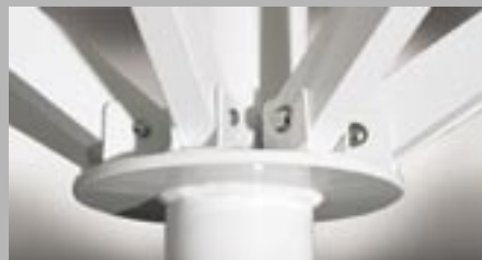
Circle of struts: strongly dimensioned parts and sturdy workmanship guarantee a long useful life.

"Big Ben" is distinguished by its sturdy materials and robust construction. The 80 mm thick mast made of 3mm thick aluminium piping is light and yet extremely stable. Strong 40 x 20 mm struts and robust joint connections can take high loads without being damaged.